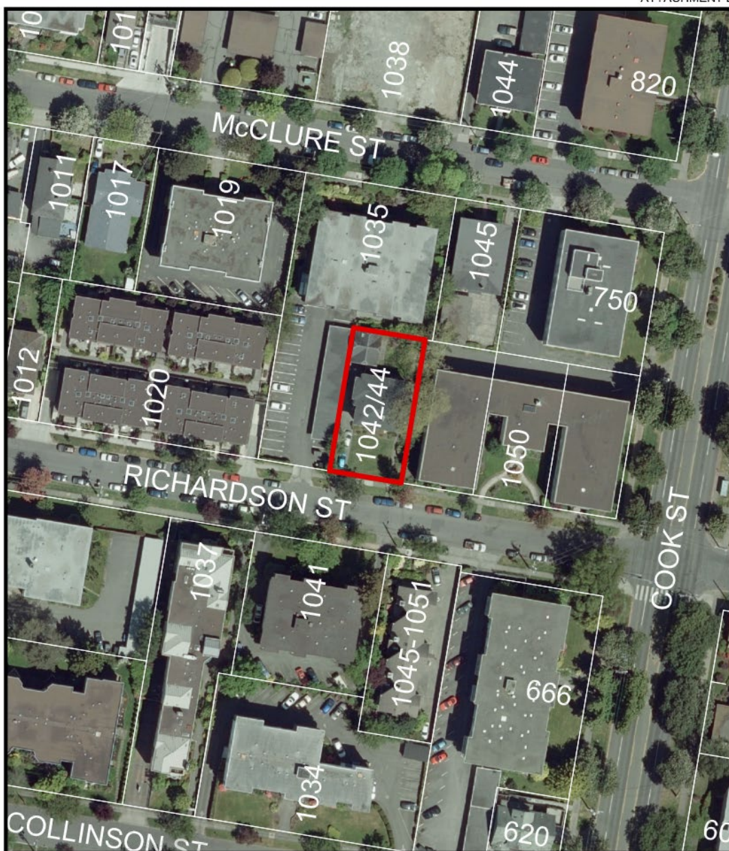
Figure 1 shows the location of the subject property